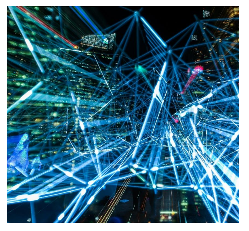
Within Activity 4.11. IT Audit Manual updated in accordance with GUID - 5100 - Guidance on Audit of Information Systems (test manual on IT pilot audit), a detailed GUID 5100 analysis and comparison was performed with all participants, resulting in the formulation of initial changes and additions to the IT Audit Manual.

report on outcomes of ITSA and ITASA recommendations from the previous IPA 2013 twinning project all the recommendations made as a result of ITSA and ITASA were reviewed and their implementation analyzed. It was also analyzed how those changes reflected on e.g. laws change, development of new documents and/or procedures, implementation of new software. etc. An online survey of ITSA and ITASA participants provided their cognitive opinion on the implementation of the recommendations made in the self-assessments. An initial mapping of the current state of implementation of ITSA and ITASA recommendations was